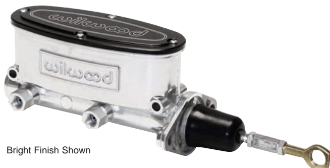
Bright Finish Shown