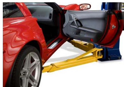
Lift arms shown with optional foot guards