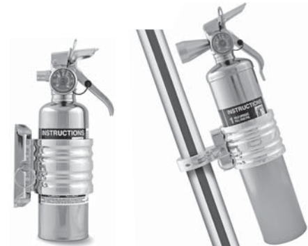
Above image shows billet mounting accessories sold separately