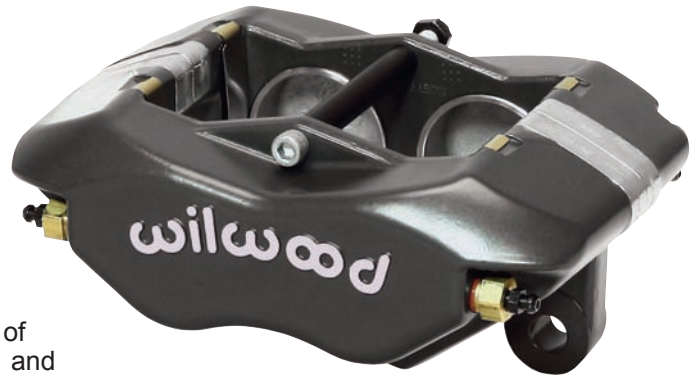
■ Black Anodize

Wilwood's new Forged Narrow Mount Dynalite (FNDL) calipers are ideal for many competition applications including late models, modifieds, sprints, off road and road racing. Computer generated design and stress analysis technology, is the latest innovation from Wilwood providing substantial improvements in strength and performance over all comparable caliper models.