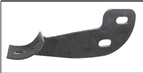
Driver Sidebar Bracket – 3 pcs