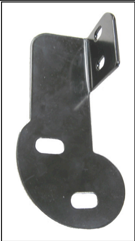
Passenger Side Mounting Bracket 3 pcs