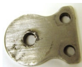
T002 TigerClamp Tab