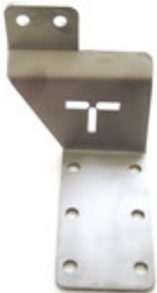
T065 Door Bar Floor Mount