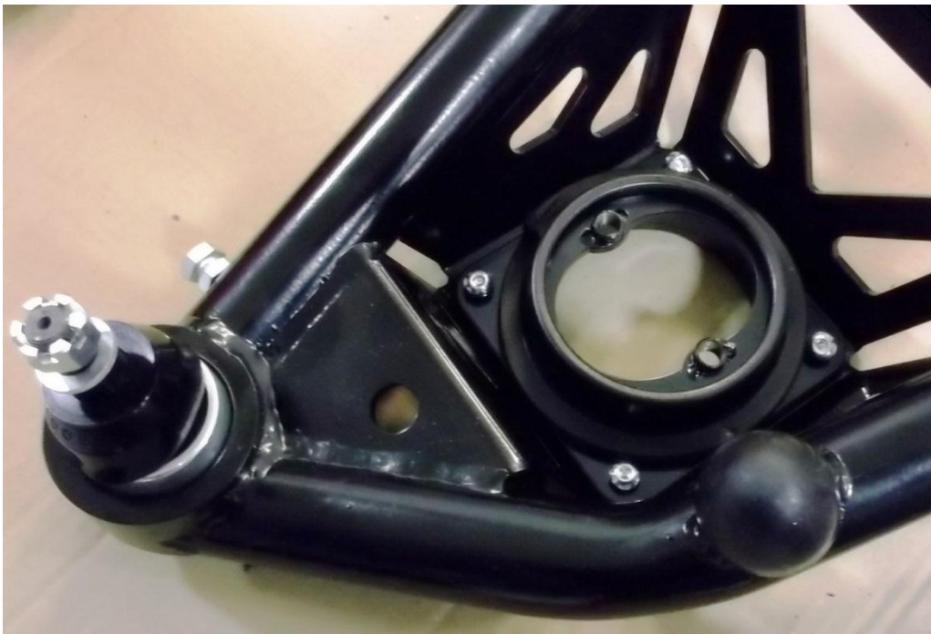
Figure 1 (P/N 7720-168)