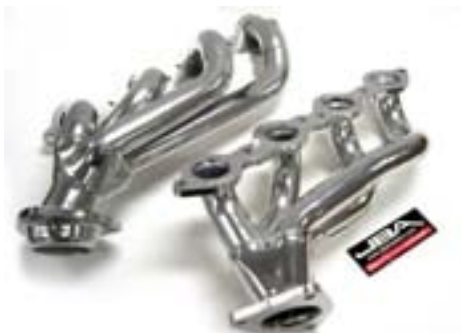
JBA Cat4ward® Headers p/n 1850-2JS

To get more power out of your Tahoe or Yukon, JBA offers easy to install 50 state smog legal performance headers and ignition wires. For more information about these and other quality performance products from JBA visit us online at www.jbaheaders.com