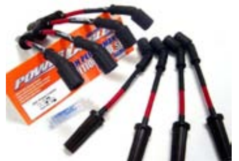
JBA Powercables™ Ignition Wires p/n 0807