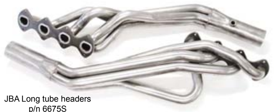
JBA Long tube headers p/n 6675S

To get more power out of your Mustang, JBA offers long tube headers-headers and high flow h-pipes for the 4.6L. For more information about these and other quality performance products from JBA visit us online at www.jbaheaders.com