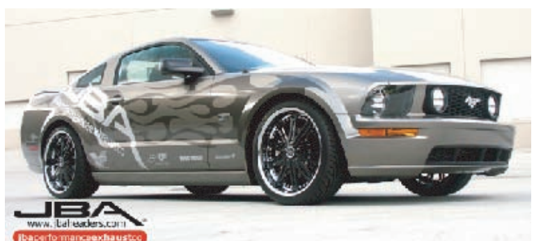
2005 Mustang GT JBA Project Vehicle See more pictures of this car at www.jbaheaders.com