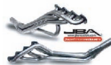
JBA Long Tube Headers Part No. 6675S

JBA also offers long tube headers, shorty headers, and h-pipes for the 05-06 Mustang. For more information about these and other quality performance products from JBA visit www.jbaheaders.com