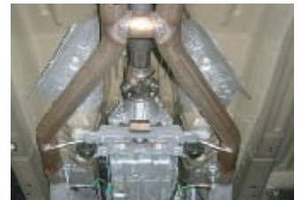
JBA Off-road H-pipe Part No. 6675SH