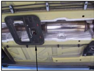
TUNNEL BRACE (TO BE RE-USED)