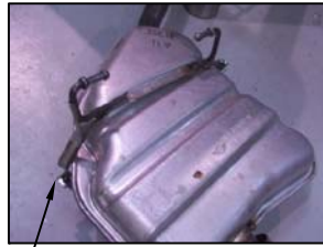
HANGER STRAP (TO BE REMOVED)