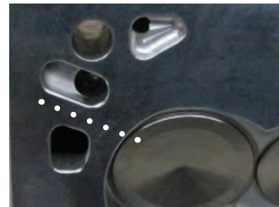
Figure 2— Silicone Bead Location

NOTE: When using Fel-Pro Print-O-Seal, or any silicone beaded gasket, you must apply a small strip of silicone to both the deck flange of the cylinder head, as shown below, and the same location on the surface of the block to prevent coolant from contaminating the engine oil.