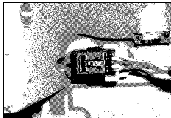
Figure 5 - Crankshaft Position Sensor