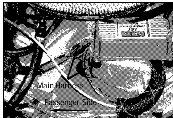
Figure 4 - Timing Control Module Mounting