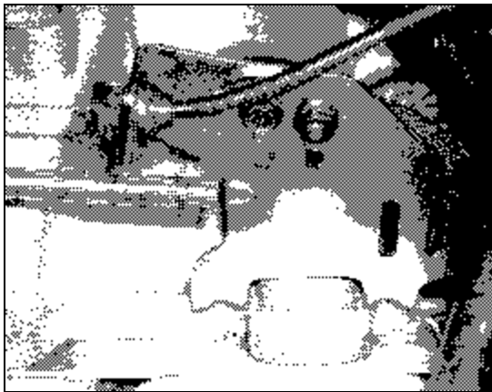
Figure 2 - Throttle Cable Bracket