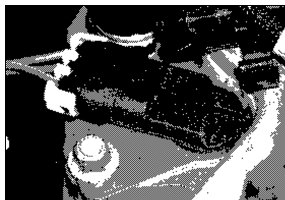
Figure 6 - Camshaft Position Sensor