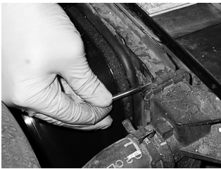
Insert the temp. sensor near the inlet hose...