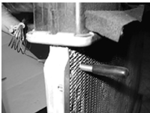
Then push the insulator cap over the end of the sensor.