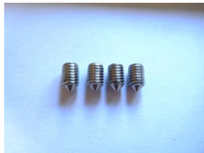
10-32 x 5/16" Cone Point Set Screw (4)