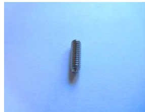
8-32 x 1/2" Set Screw