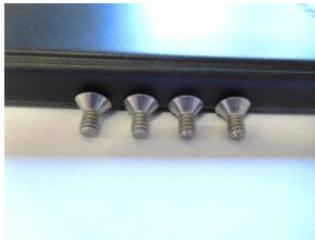
6-32 x 5/16" Flat Head Screw (4)