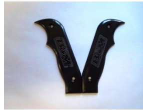
Shift Handle Grip Plates