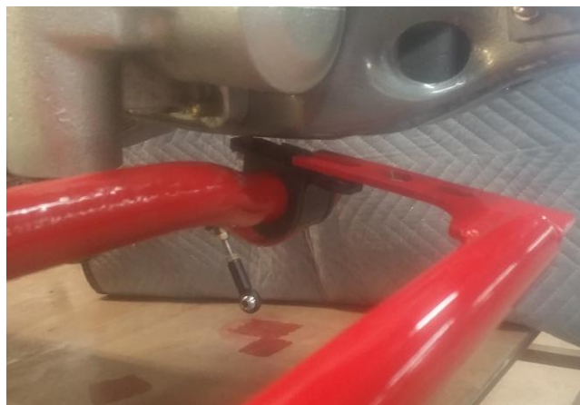
Figure 2) Inserting brace slots onto the rear sway bar bolt