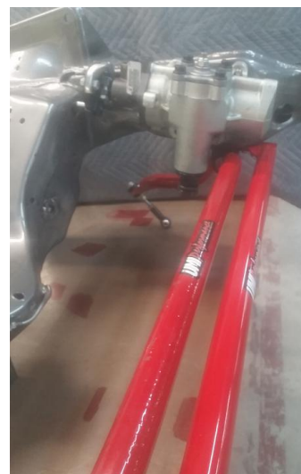
Figure 4) Fully Installed