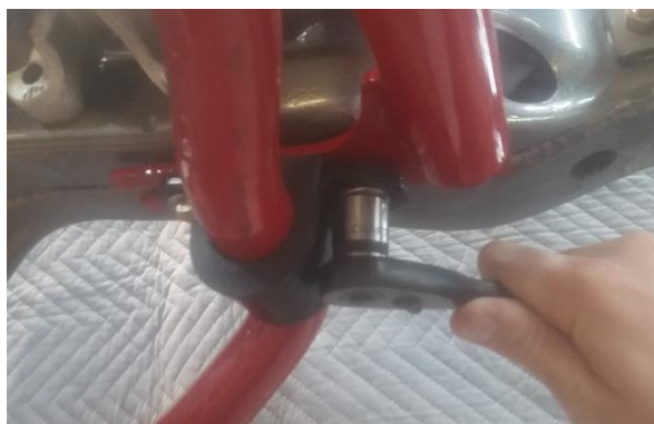
Figure 3) Tighten sway bar bolts down once all four bolts are started