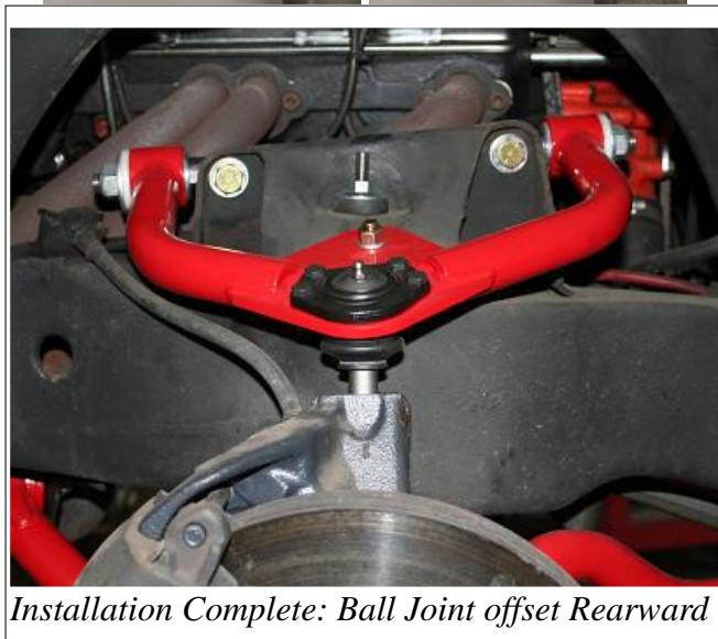
Installation Complete: Ball Joint offset Rearward