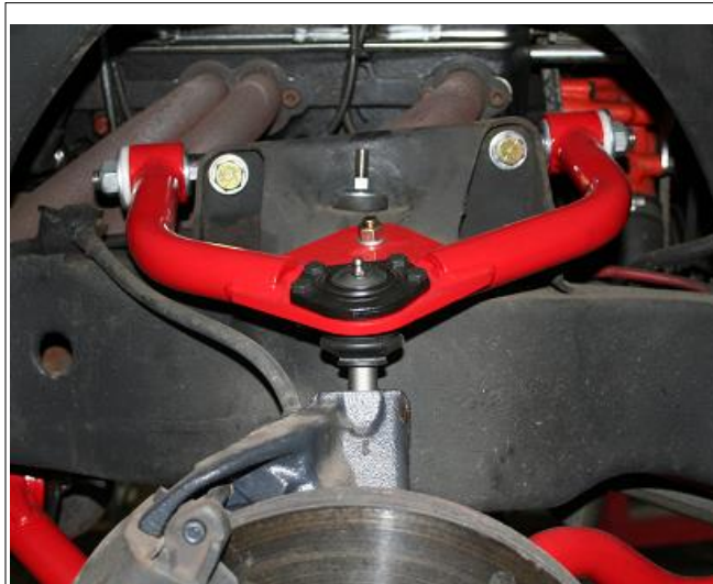
Installation Complete: Ball Joint offset Rearward