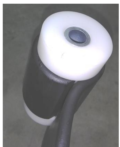
Rear Bushings – Delrin Shown