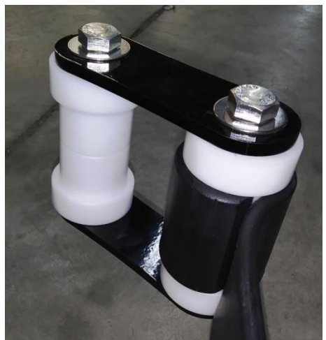
Rear Shackles – Delrin Shown (out of car to show detail)