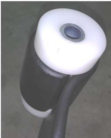
Rear Bushings – Delrin Shown instead of Poly