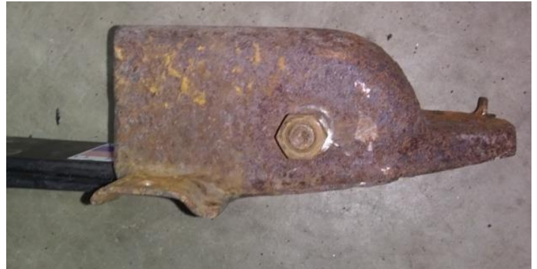
Front mount installed on spring