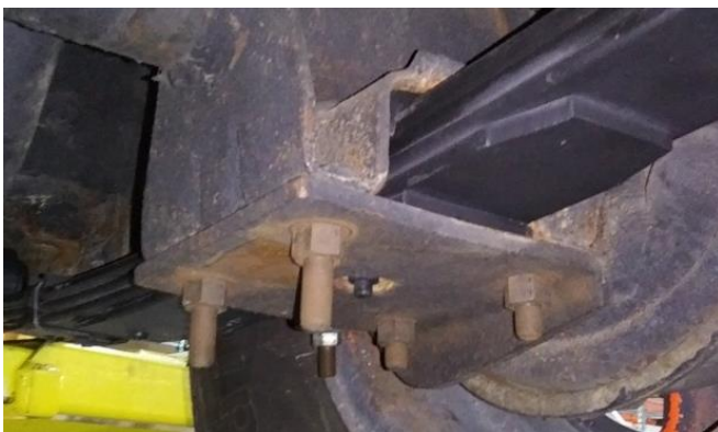
Lower Spring Plate – Ubolt / Tbolt Locations