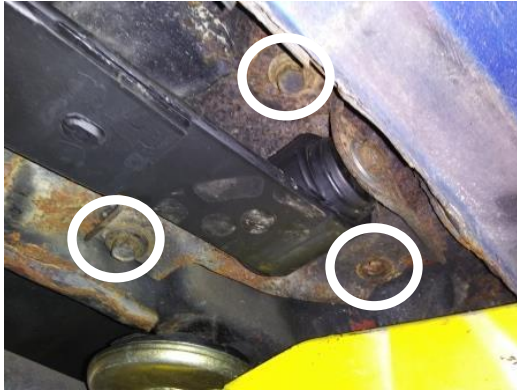
Location of (3) front mount bolts