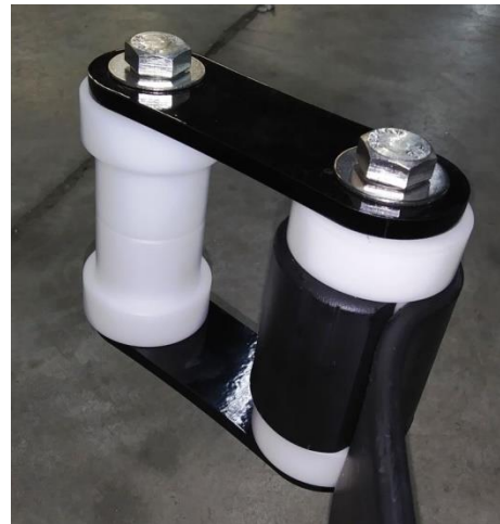
Rear Shackles – Delrin Shown instead of Poly (out of car to show detail)