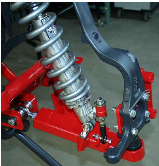
Image 1- Lower A-Arm with shock installed.