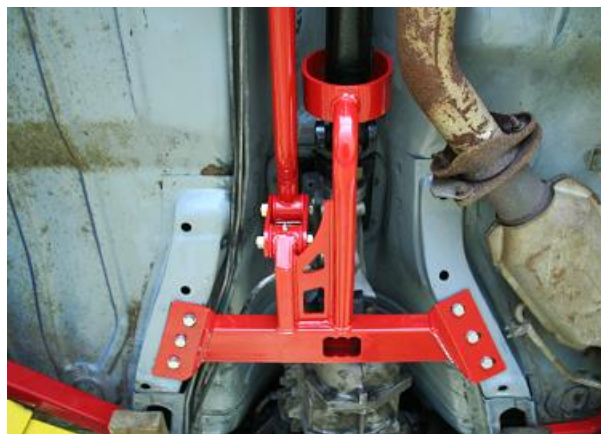
Image 4- Completed Installation