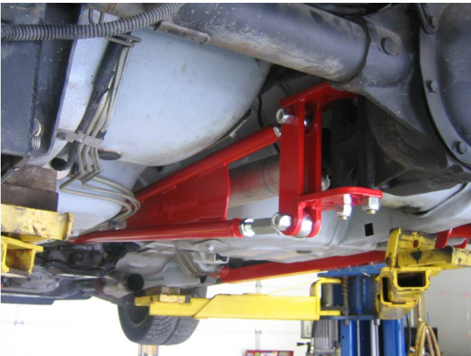
Image 4- Completed Installation with TSP True Duals