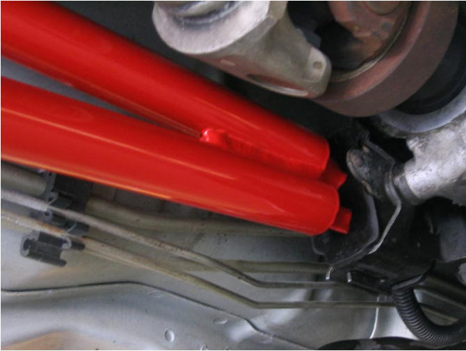
Image 2- Rear Torque Arm Mount Bolted to Stock Rear-End