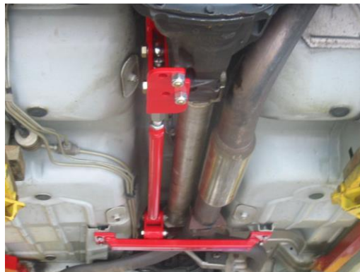
Figure 4: Completed Installation