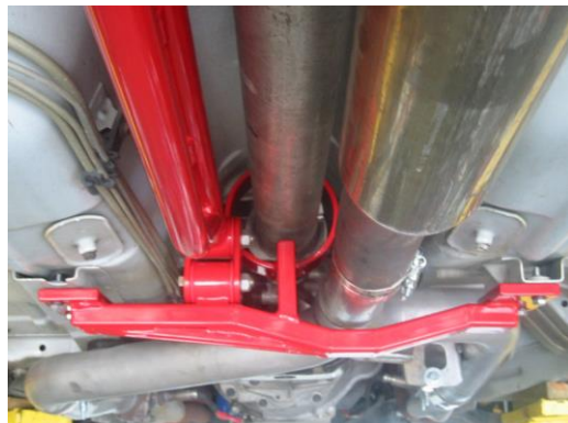
Figure 3: Item # 2203 Installed with Front Drive Shaft Loop