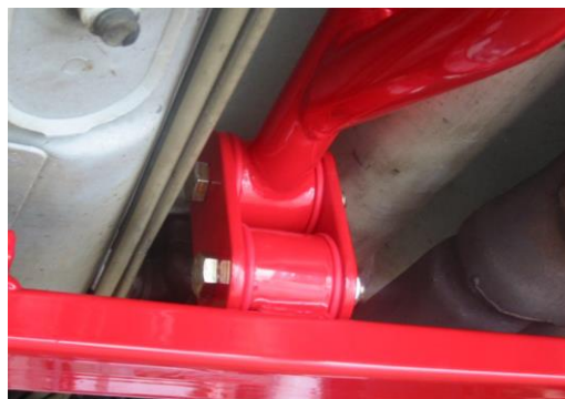
Figure 2: Torque Arm Attached using Pivot Plates