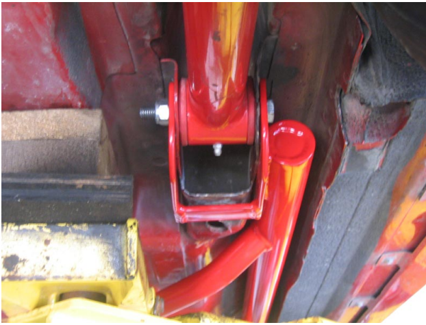
Image 3- Tunnel Mount