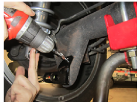
Figure 3 – Drilling for 3/8" reinforcement