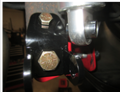
Fig 2 – Lower bracket location