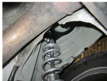
Fig 5 – Upper bracket install