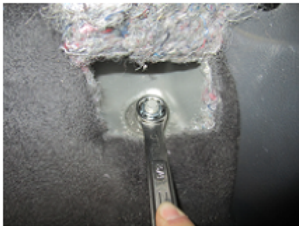
Fig 1 – Upper shock bolt