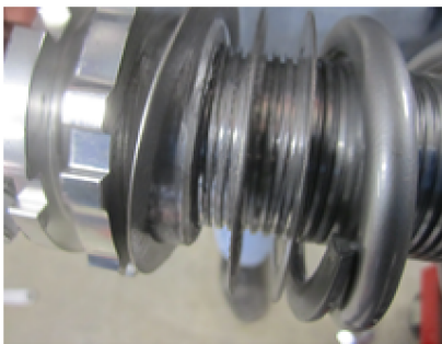
Fig 4 – Assembly order (optional bearing and washer)