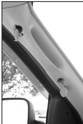
Dodge Ram Shown (Photo 1)