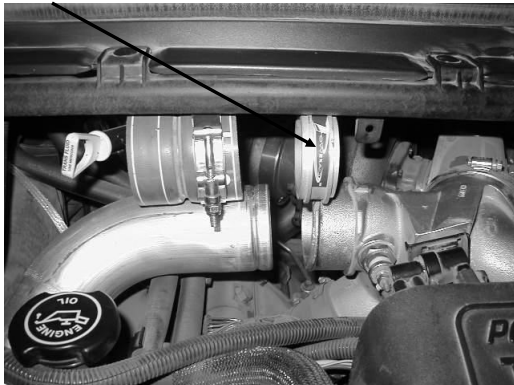
Ref. A– Power Plate