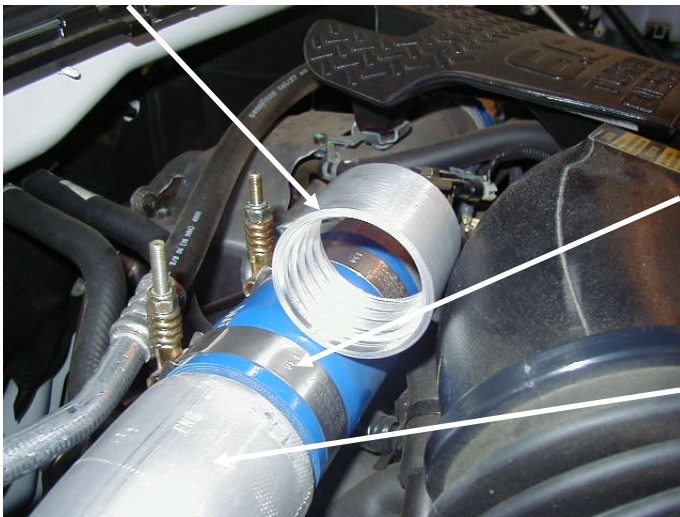
Ref. "A" - Power Plate