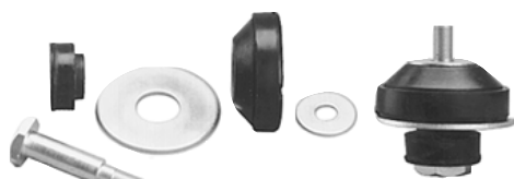
Speedway Rubber Cushion Kit (720-9314)

We recommend the use of Speedway mount cushion kit as illustrated. The use of improper bolts or mounts may cause engine shifting or vibration.