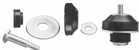
Speedway Rubber Cushion Kit (720-9314)