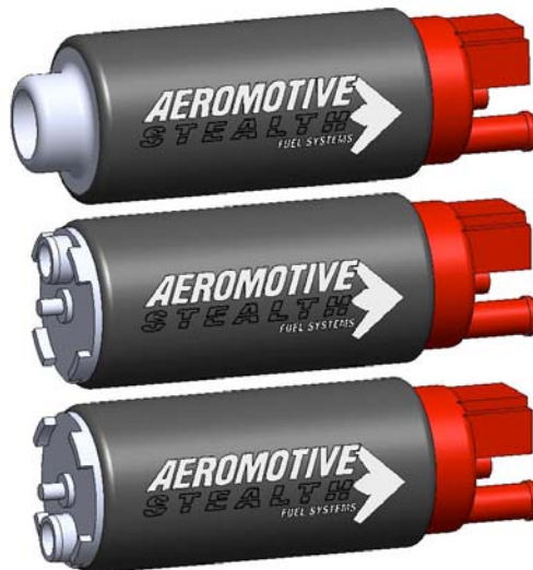
11140- Center Inlet