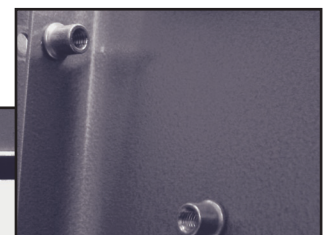
Rivet Nut Repair

S-B GROUP Bringing products and people together.